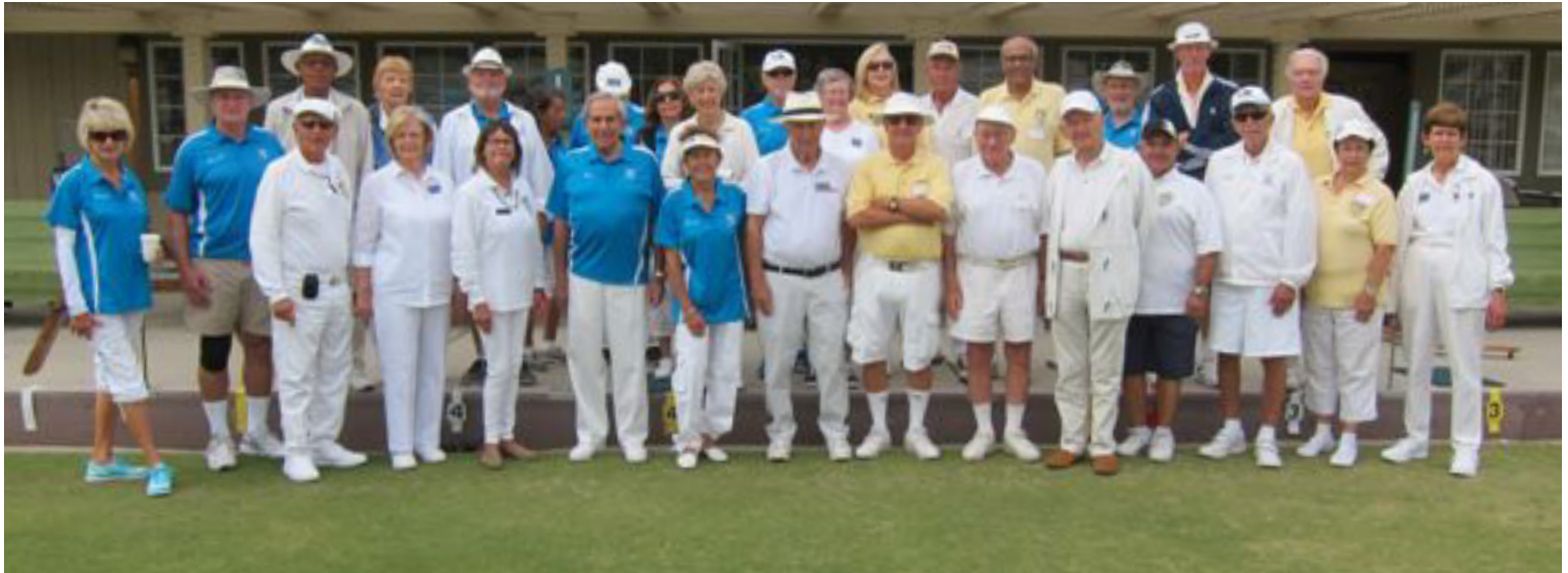
Holmby bowlers on June 3 during our annual visitation at Oxnard LBC.